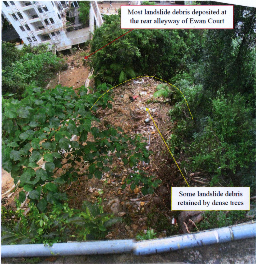
Deposition of Landslide Debris at Ewan Court